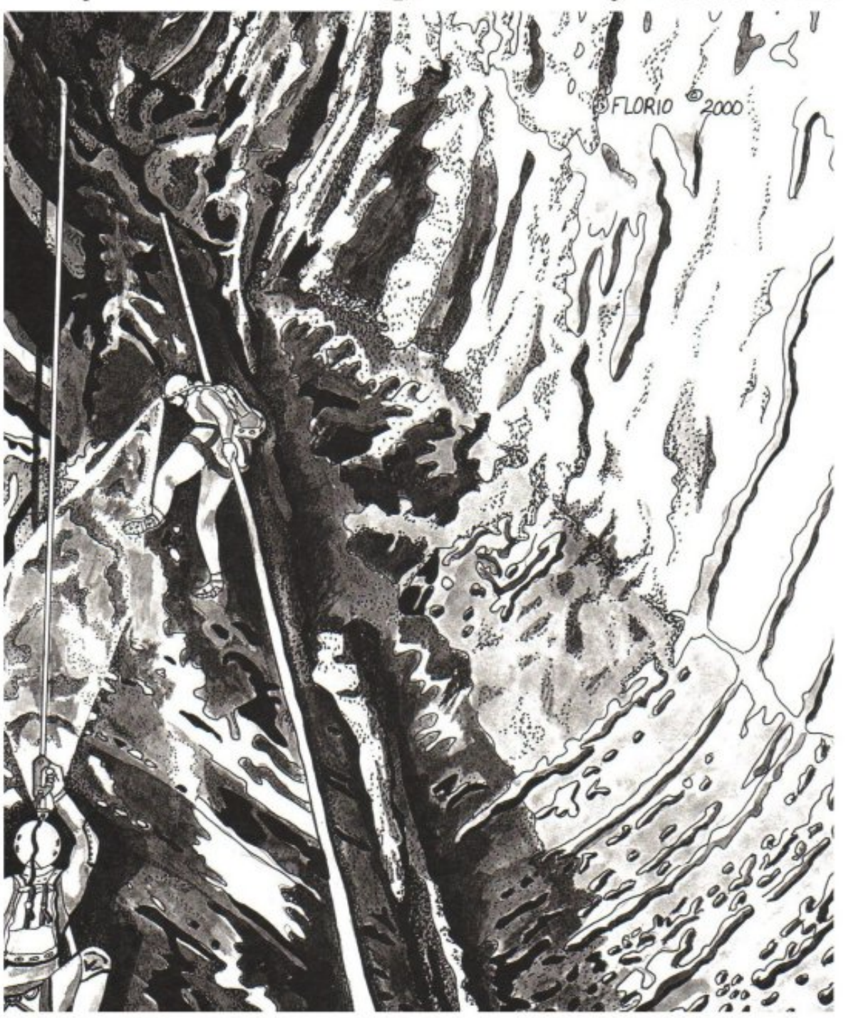
... especially for the Vertical Caver